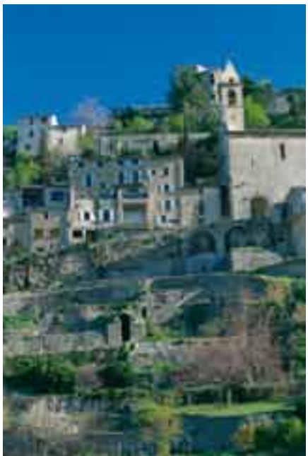
Rhône-Alpes reconciles effective transport infrastructures (top photo: TGV station at Lyon Saint-Exupéry airport) and an exceptional living space (bottom photo: Montbrun-les-Bains, Drôme).