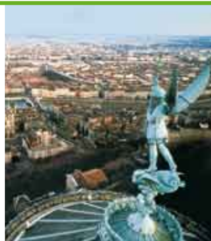
A view of Lyon.

In regards to the Euro-Mediterranean free trade zone, the Region is active in Algeria (Wilayas of Sétif and Annaba), Tunisia (Gouvernorat de Monastir), Morocco (Rabat Region) and the Lebanon (Tripoli Region). This spread of influence is accompanied by specific solidarity actions in Africa (Mali,