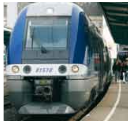
The lycées and regional public transport are part of the Region's major fields of competence.